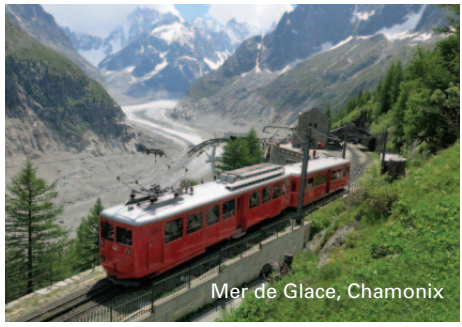
Mer de Glace, Chamonix